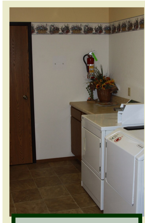
On Site Laundry